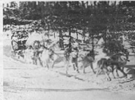
ON THE TRAIL